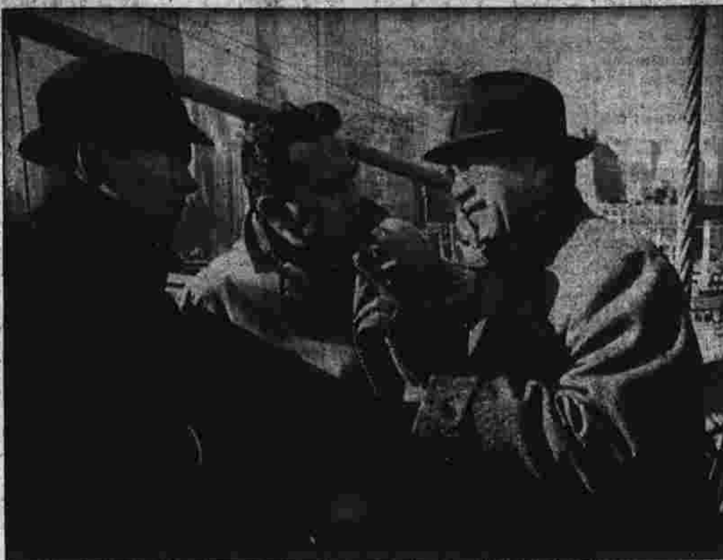
William Shatner, Lonny Chapman and Howard Da Silva meet on New York's Brooklyn Bridge to discuss a homicide case in a scene from the new CBS series, "For the People," tomorrow 9-10 p.m.